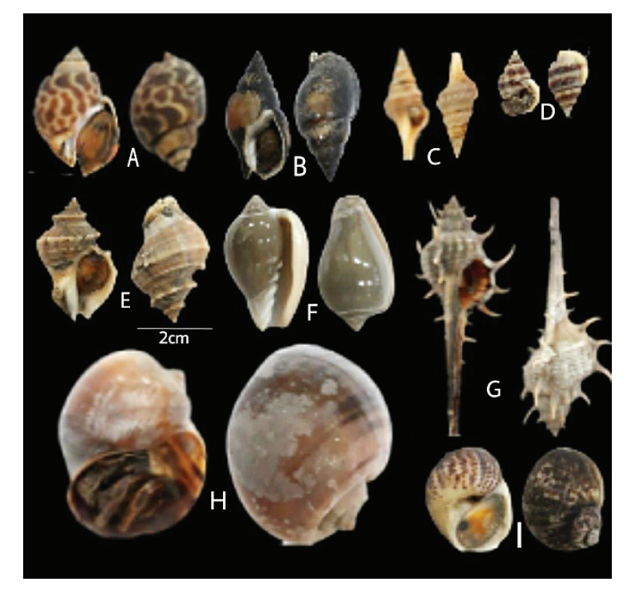
Figure 2. Gastropods species in Sedati Waters

of the case (Baharuddin and Zakaria, 2018). The basic forms of gastropod shells have three, namely conical, spiral, and Planospiral (Pyron and Brown, 2015). The gastropod shells are several parts that can be used as identification keys, and those parts are the apex, body whorl, spire, columella, umbilicus and aperture (Sturm et al., 2006). The gastropods with spiral shell forms, such as Babylonia spirata , Nassarius olivaceus , Turricula javana , Nassarius stolatus , Rapana venosa and Cryptospira ventricosa , are dominant.